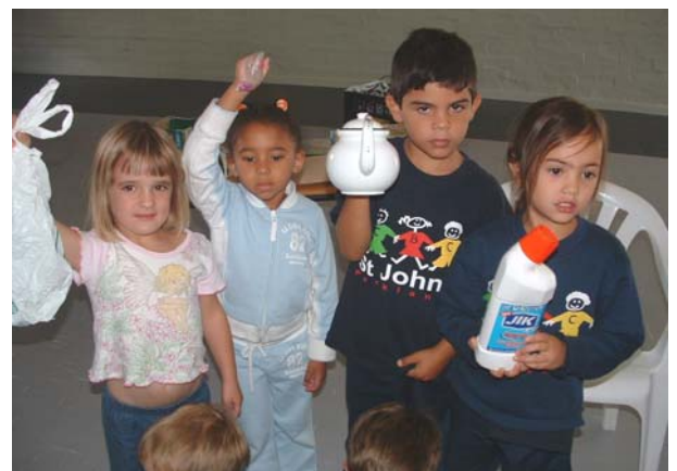
Pre-Schoolers from CBC St Johns