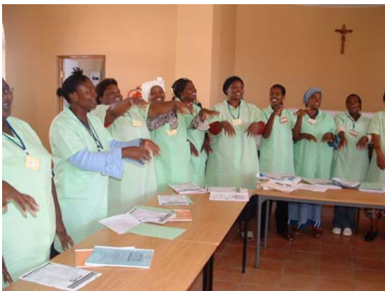
Training for Zankhanyo - Khayelitha

The Foundation received numerous requests to present child safety education initiatives. Due to a staff shortage, not all the requests could be met. More than 1800 individuals were however reached through talks, workshops lectures and training. The following are some examples of talk and workshops that were conducted: