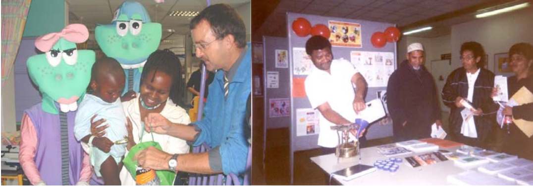
Woolworths' My School characters, Xena and Torak handed our party packs and toys to Red Cross Children's Hospital patients

My School Characters, Xena and Torak handed out party packs and gifts to the patients. Four hundred party packs were distributed to paediatric patients at the following hospitals: Red Cross Children's Hospital, Tygerberg and Groote Schuur Hospitals, St Josephs, Sara Fox, Maitland Cottage, Brooklyn Chest and Princess Alice Hospitals.