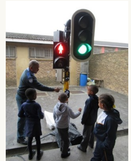
A police officer interacts with learners

Moving forward, Childsafe alongside the road safety partners continues to look at innovative ways to educate children interactively and this includes the live demonstration of a mobile pedestrian safety robot to learners to instruct on the management of a pedestrian robot when crossing safe places. Whilst every effort is made to reinforce road safety message through repeated learnings at regular intervals, children need to 'learn through play' using visual stimuli.