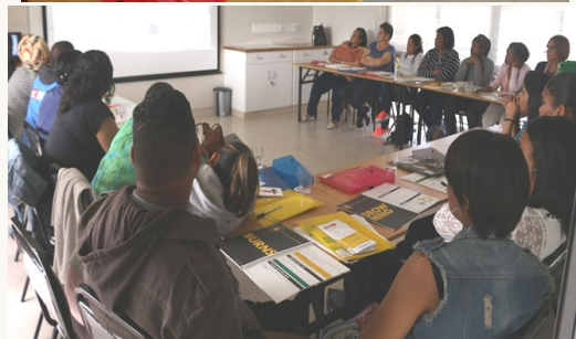
Participants during the training