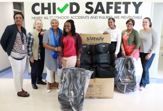
Childsafe team with the donation

These car seats are still being distributed to patients from Red Cross War Memorial Children's Hospital. Childsafe would like to thank Wheel Well for their continued support in creating a safer place for children in South Africa.