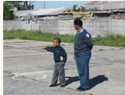
A learner proudly demonstrates what he has learnt

Key lessons followed simple key messages on the dangers of crossing the road; rules on how to cross the road; and where to cross the road. Child road safety messages were communicated in an instructional manner and included interactive and/or illustrative demonstrations by means video clips and 'learning through play'.