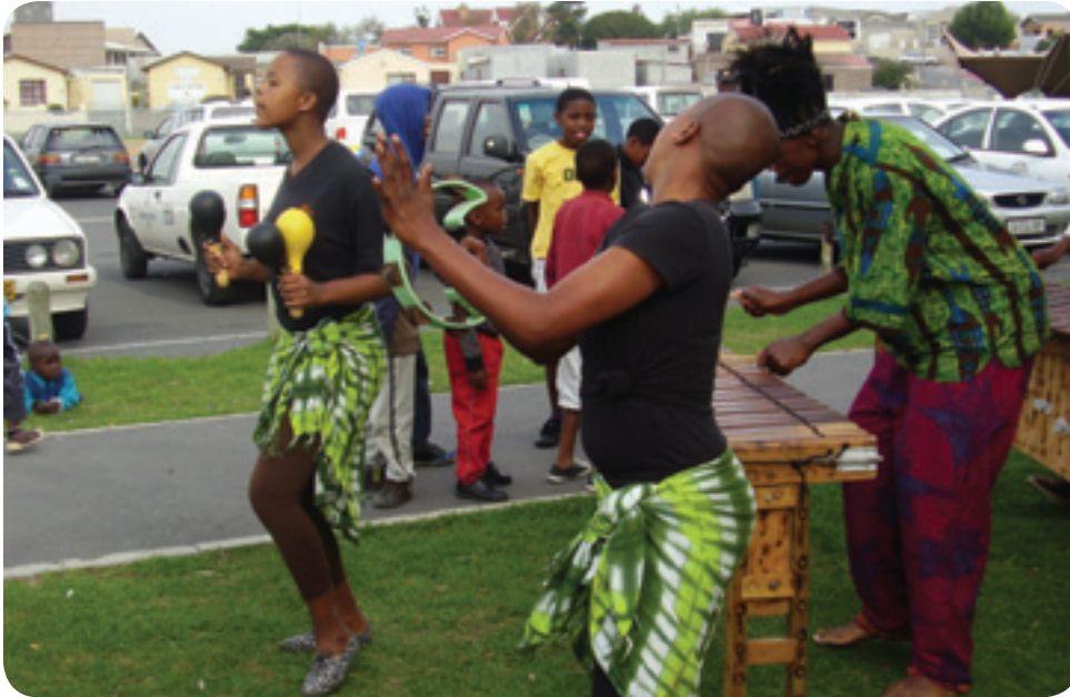
Marimba dance group –part of entertainment