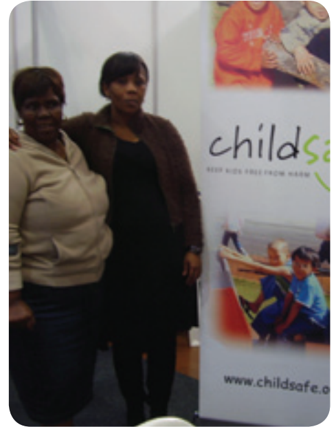
Members of the public at Childsafe stand

In celebrating the International Year of Families, the Department of Social Development hosted a three days Family Expo from the 20-22 May 2011 at the Gugulethu Indoor Sports complex. Social Development identified the FAMILY as the basic unit of society that needs to be strengthened so that it can continue to play its rightful role in society, namely, the physiological, economic, spiritual, physical and social care and protection of its members.